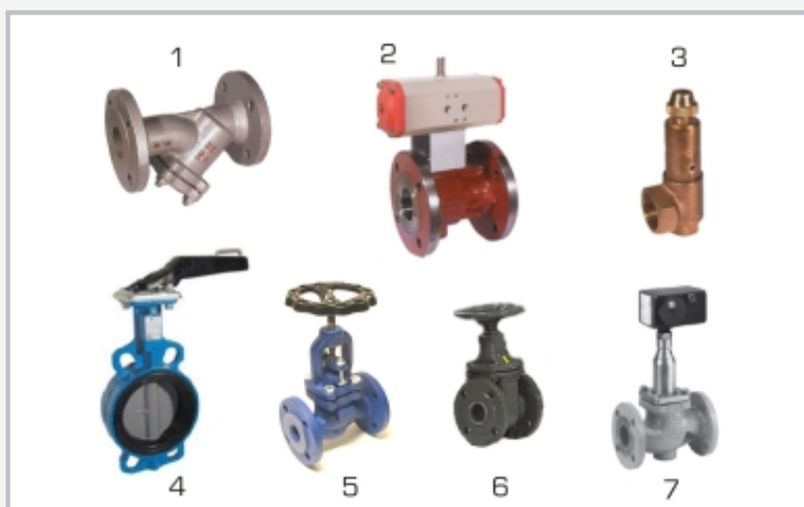
Supplied valves and fittings: 1 dirt trap, 2 ball valve, 3 safety valve, 4 butterfly valve, 5 shut-off valve, 6 wedge gate valve, 7 control valve