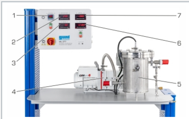
1 temperature controller with temperature display, 2 temperature display, 3 power display, 4 vacuum pump, 5 pressure vessel, 6 vessel's absolute pressure display, 7 vessel's relative pressure display