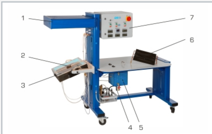
1 lighting unit, 2 illuminance sensor, 3 flat collector with spacing and inclination adjustment, 4 electrical auxiliary heater, 5 hot water storage tank, 6 replaceable absorber, 7 control cabinet