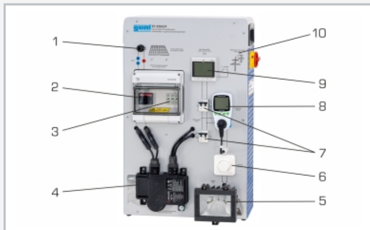
1 connector for photovoltaic modules, 2 DC switch-disconnector, 3 over voltage protection, 4 inverter, 5 halogen lamp, 6 dimmer, 7 fuses, 8 energy meter own consumption, 9 two way energy meter grid, 10 grid connection