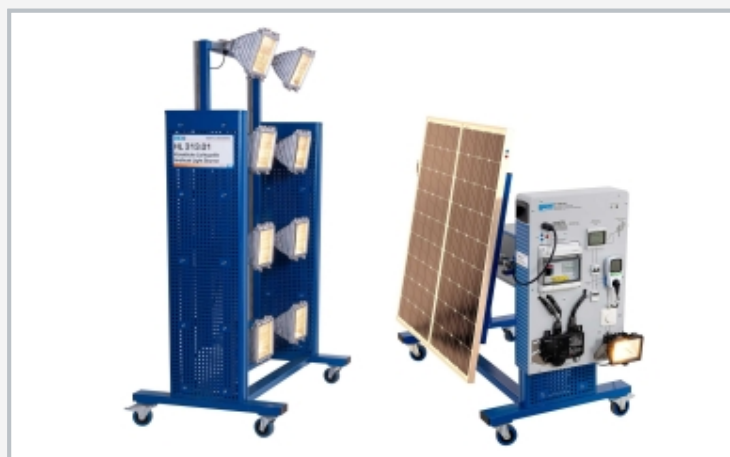
The illustration shows ET 250.01 together with ET 250 and the artificial light source HL 313.01