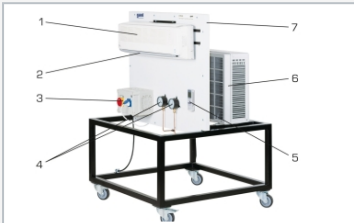
1 air inlet inner unit, 2 air outlet inner unit, 3 switch cabinet, 4 manometer, 5 remote control, 6 outer unit, 7 dividing wall