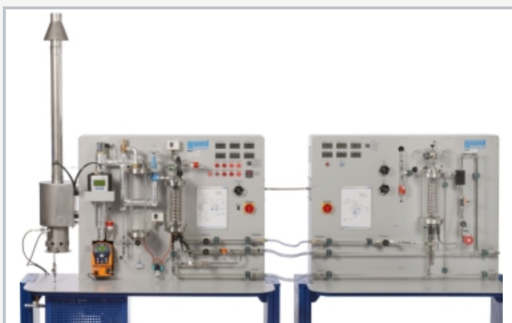
Left: ET 850 steam generator; right: ET 851 axial steam turbine; set up ready for operation, together they form a steam power plant