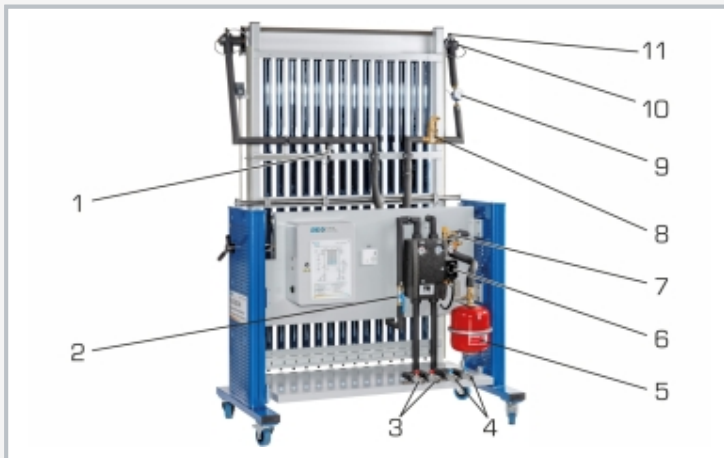
1 pressure sensor, 2 shut-off valve, 3 connectors for hot water, 4 connectors for cold water, 5 diaphragm expansion vessel, 6 circulation pump, 7 pressure relief valve, 8 bubble separator, 9 flow sensor, 10 temperature sensor, 11 vent valve