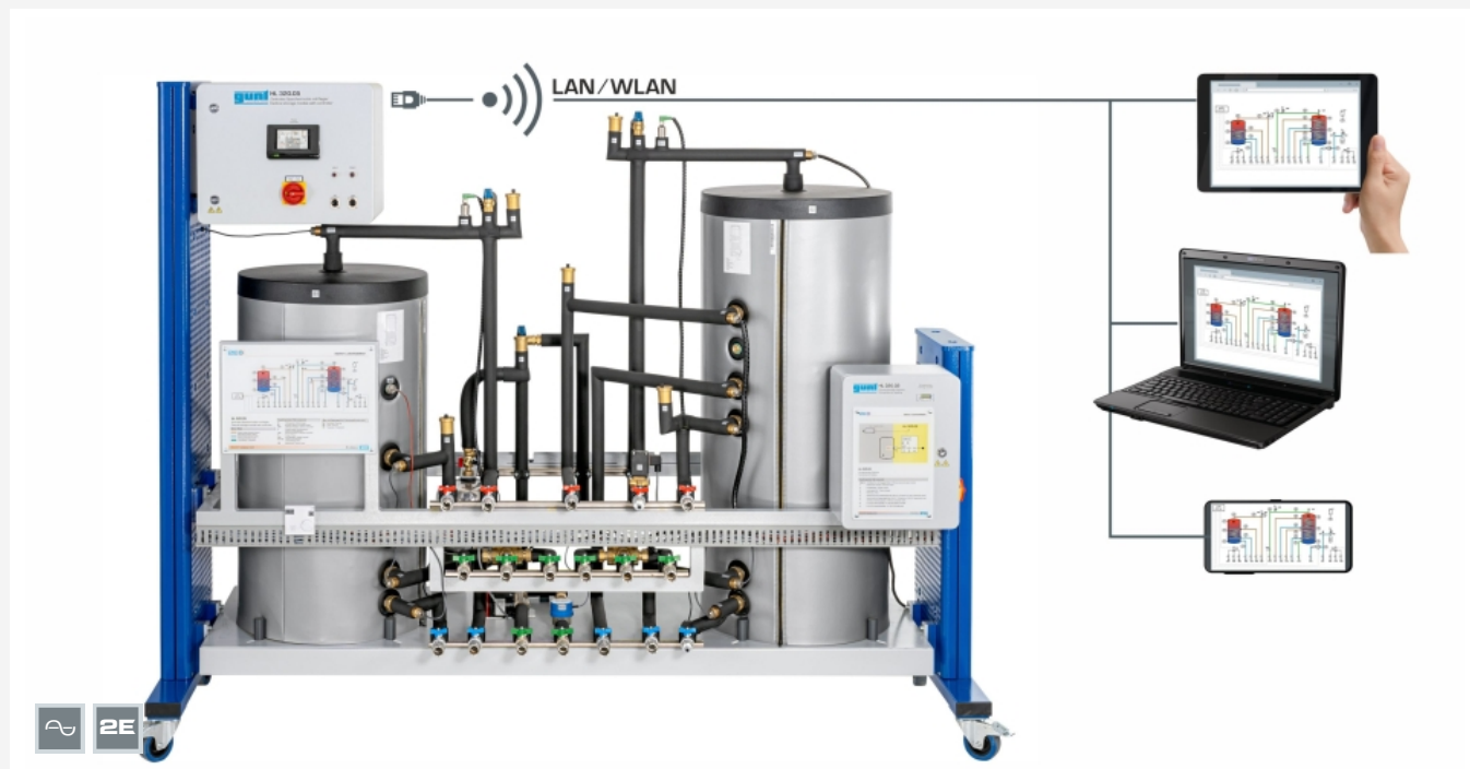
The illustration shows HL 320.05 with the switch box for HL 320.02; display of the heating controller's user interface on any number of end devices