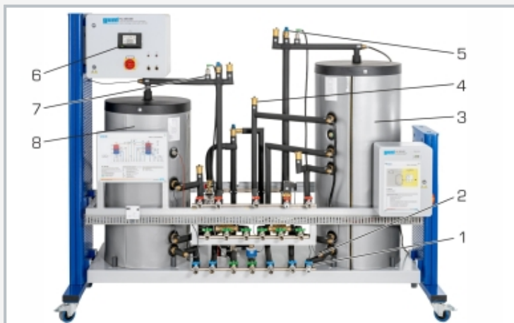
1 fresh water inflow, 2 temperature sensor, 3 bivalent storage, 4 bleed valve, 5 pressure relief valve, 6 freely programmable heating controller: : operation via touch screen or web browser, 7 pressure sensor, 8 buffer storage