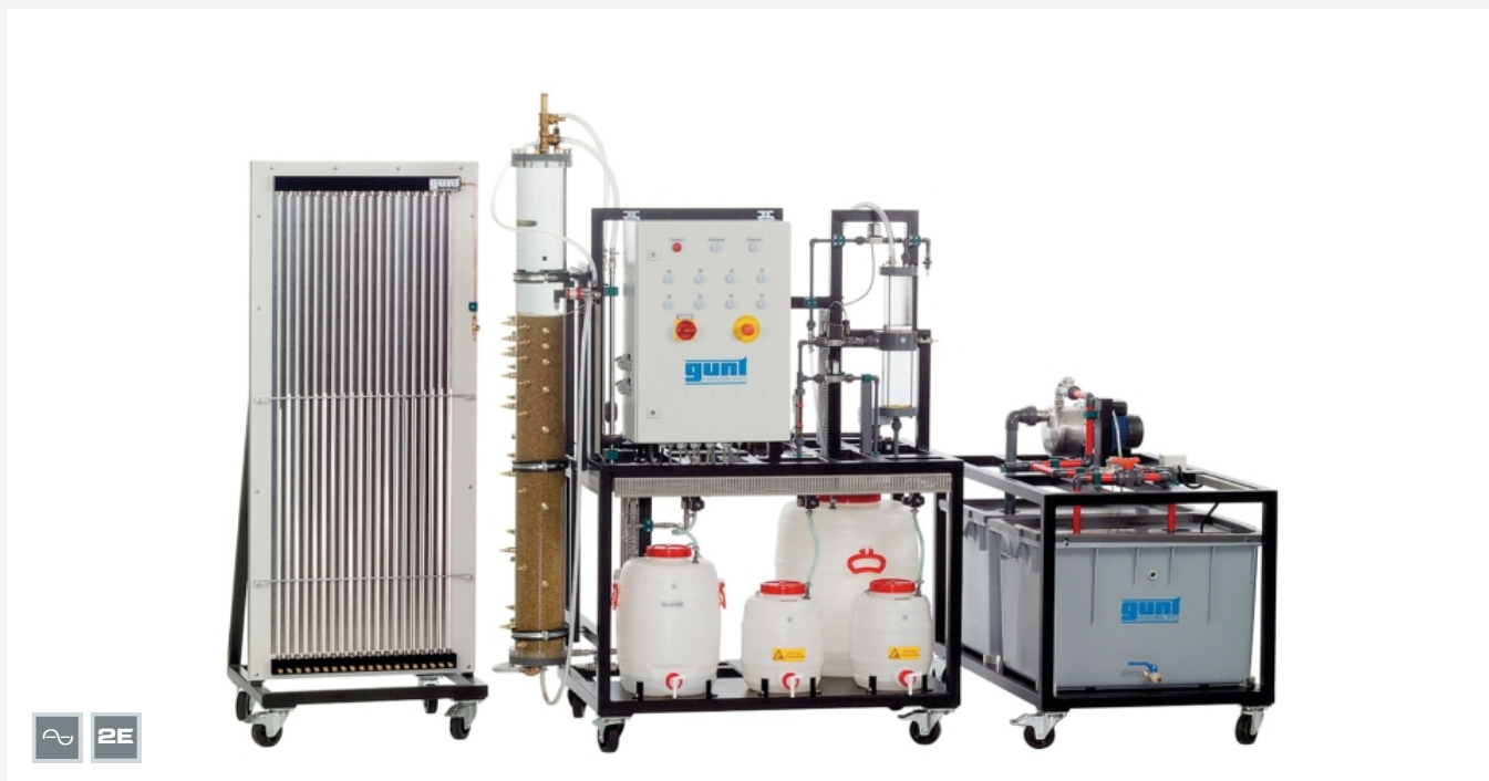
The illustration shows from left to right: manometer board, trainer, supply unit