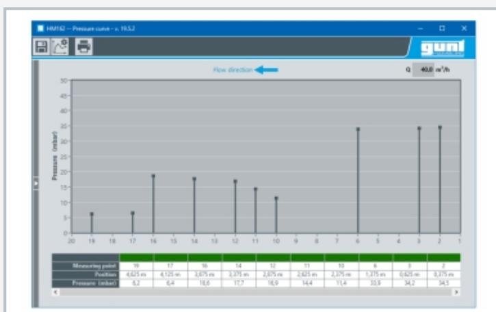
Software screenshot: experimental setup with two control structures (gate at measuring point 17, weir at measuring points 2, 3 and 6)