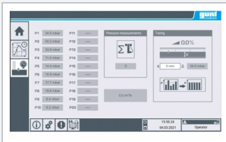
Display of pressure levels on the touch screen