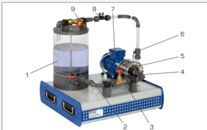
1 water tank, 2 temperature sensor, 3 valve at inlet, 4 pressure sensor at inlet, 5 pump, 6 pressure sensor at outlet, 7 motor, 8 flow meter, 9 valve at outlet